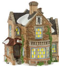
"Lea Hurst House" # 808869

daughters born to an upper middle-class British family, Florence was given all advantages possible of a young girl in the Victorian age - tutor educated, well traveled, and independent.