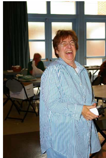
Was she crying or laughing???