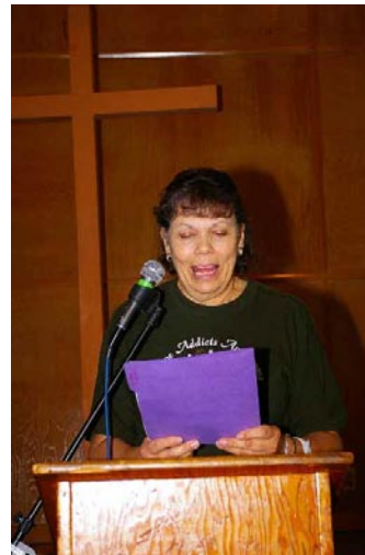
Alita...you are having way too much fun!!

OMG - Joe - is that the coveted Dickens' Village Mill??? ...and it's for sale???? - anyone who is interested please contact Joe directly - 626-577-4768