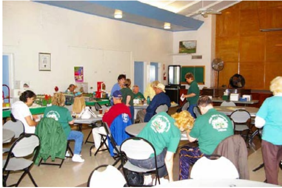
A goodly group