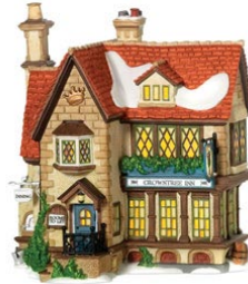
Crown Tree Inn