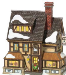
Golden Swan Baker