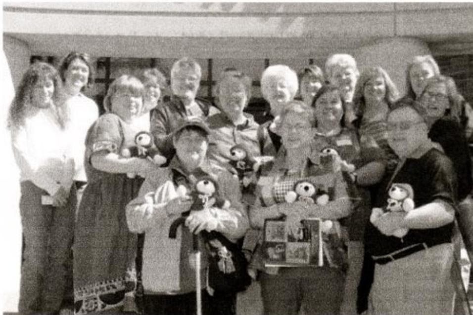
Minnesota Clubs open house at Department 56, August 2004